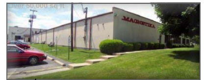
Phillipsburg, New Jersey