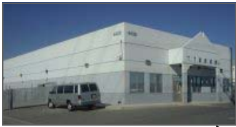
North Las Vegas, Nevada