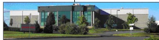
Bethlehem, Pennsylvania (June 2004)