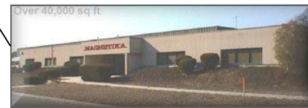
Lakewood, New Jersey